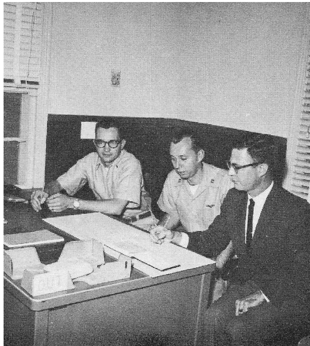
Resident auditors complete audit

USAF Unit Histories Created: 20 Sep 2021 Updated: