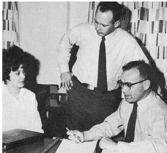
Working up Airmen personnel figures